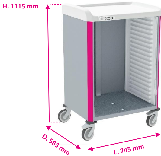
Overall dimensions of the trolley