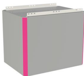
8Y546: Hanging kit for tubular plan