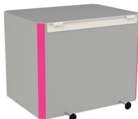
8Y545: Hanging kit for suspended plan