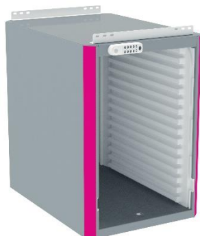
8Y547: Hanging kit for suspended work surface