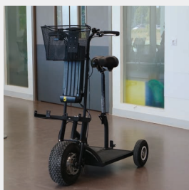
Electric scooter to optimize staff's long distance movements