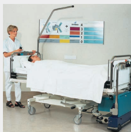
Mechanized assistance to move beds or cabinets