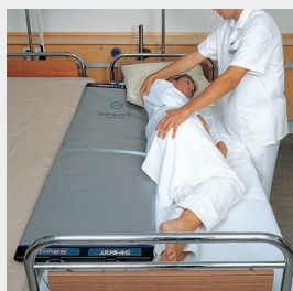
Transfer boards to transfer patients without having to lift them