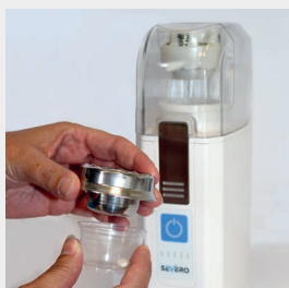
Electrical pill crushing to avoid manual crushing